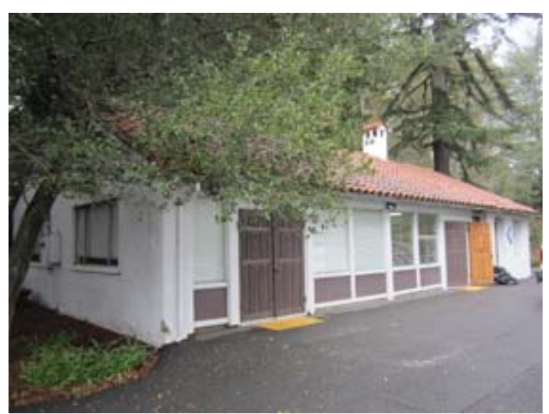
Casita building at Hacienda de las Flores